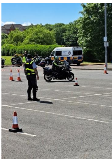
Slo Mo action.