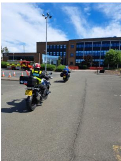
Leaving for an observed ride

This year's 'Rider Refinement' event held by Ayrshire Road Alliance was held on Sunday the 18 th of April in the car park of Ayr College and within the college building and was open to all riders holding a full rider's license. The college proved to be superb location. As you can see from the photos below, the weather was splendid. Similar to previous years, although every available training slot was pre-booked, a stubborn number for whatever reason, decided not to show-up. Those riders who did attend felt the day was extremely valuable and all said they really enjoyed the event. When asked, everyone felt the course covered all their current riding support requirements. Hopefully, this may whet their appetite for more advanced rider training.